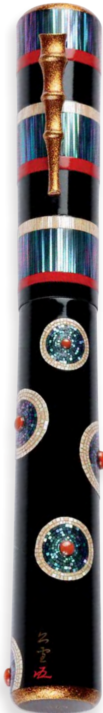
Writers Series maki-e Prayer Wheel pen, inspired by the Tibetan prayer wheel used by Buddhists. The inlays are abalone, mother-of-pearl, and coral.

The Almighty Shiva pen depicts one of the most enigmatic deities of the Hindu pantheon borne upon the back of the Divine Nandi. The edition is limited to nine pieces.