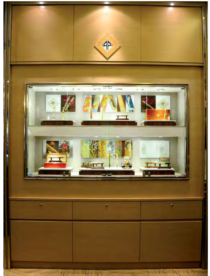
AP Limited Editions display at the renowned Singapore retailer Aesthetic Bay

to carry when traveling, a simple black Platinum that one of his maki-e artists embellished into a beautiful one-of-a-kind jewel. “I love Japanese nibs,” he says.