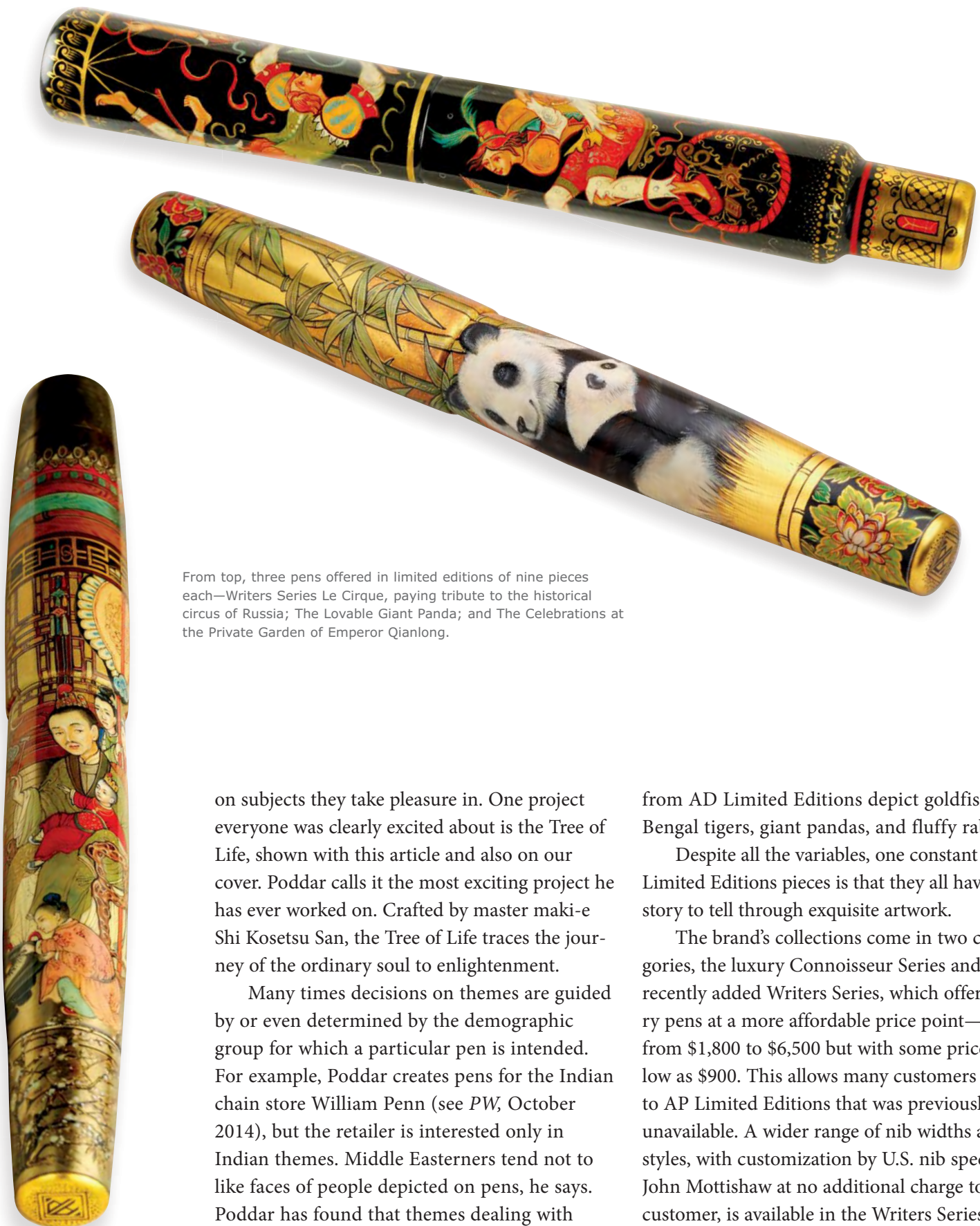
From top, three pens offered in limited editions of nine pieces each—Writers Series Le Cirque, paying tribute to the historical circus of Russia; The Lovable Giant Panda; and The Celebrations at the Private Garden of Emperor Qianlong.