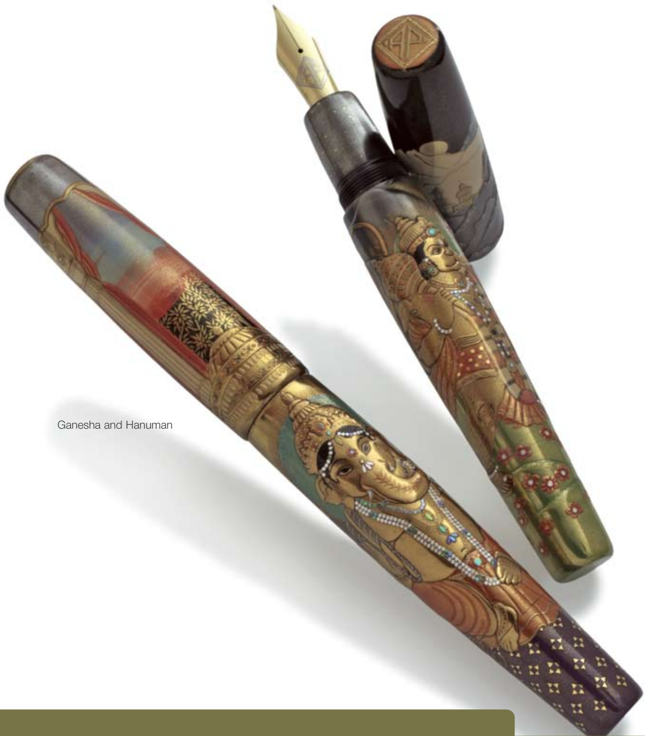
Ganesha and Hanuman