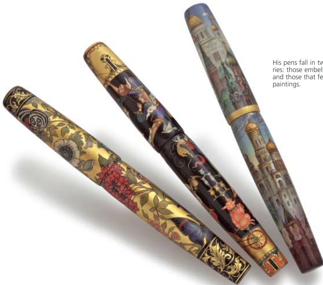
His pens fall in two distinct categories: those embellished with maki-e, and those that feature miniature paintings.